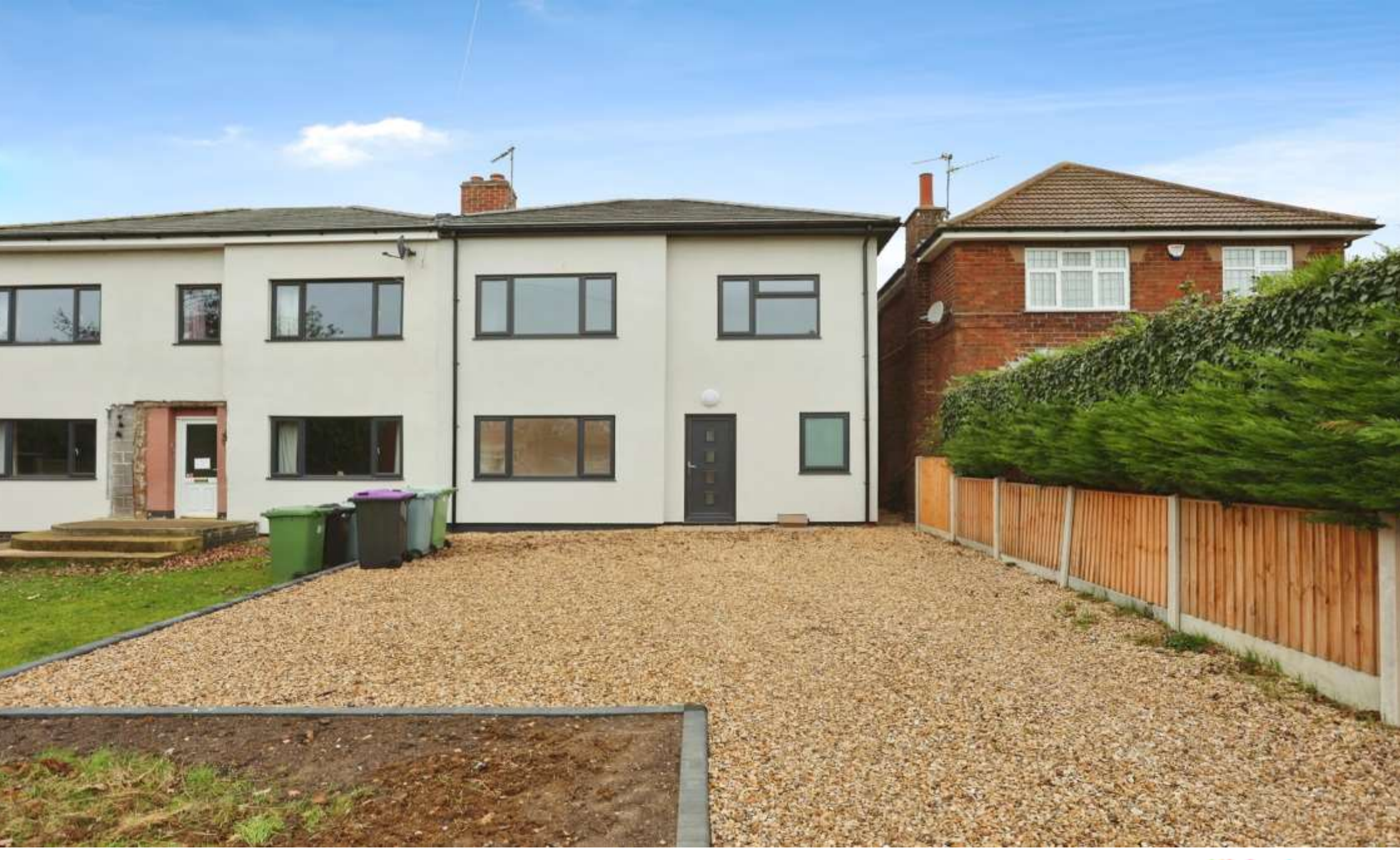
Honey Pot House, Low Road, Barrowby, Grantham NG32 1DJ