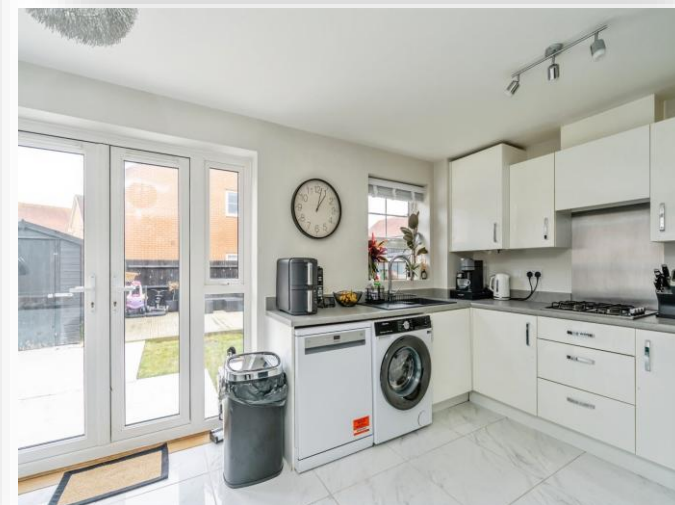
Sanctuary Gardens, Felpham BOGNOR REGIS PO22 8FF