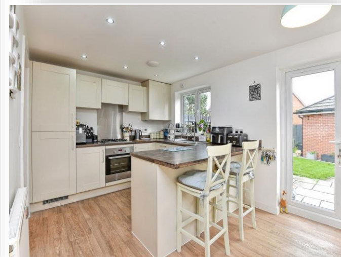
Blackbourne Chase, Littlehampton BN17 7FL