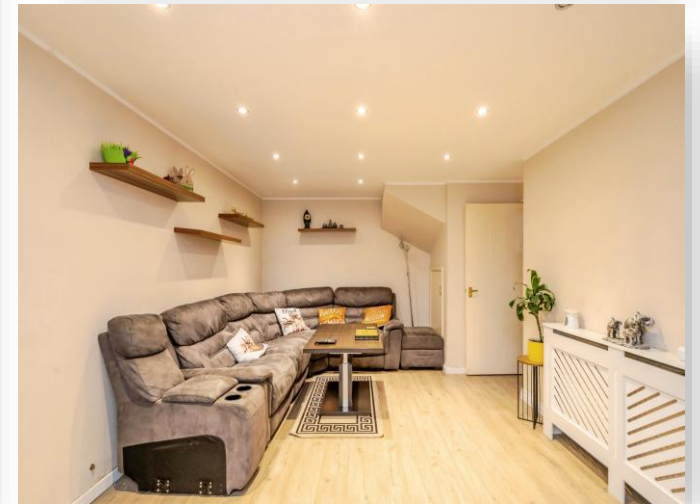
Gibson Way, Bognor Regis PO21 1AW