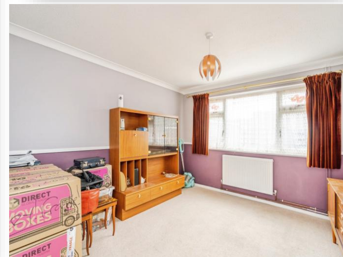
Hawks Place, Bognor Regis PO22 9LZ