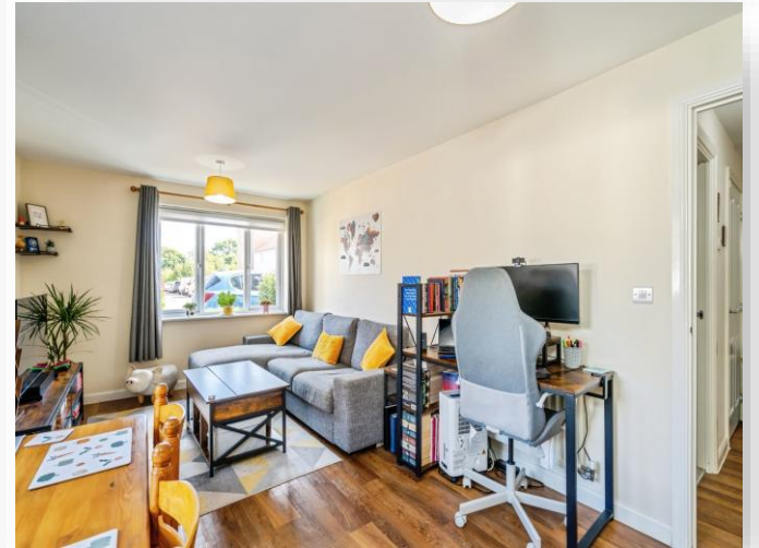
Meaden House Meaden Way, Felpham Bognor Regis PO22 8FL