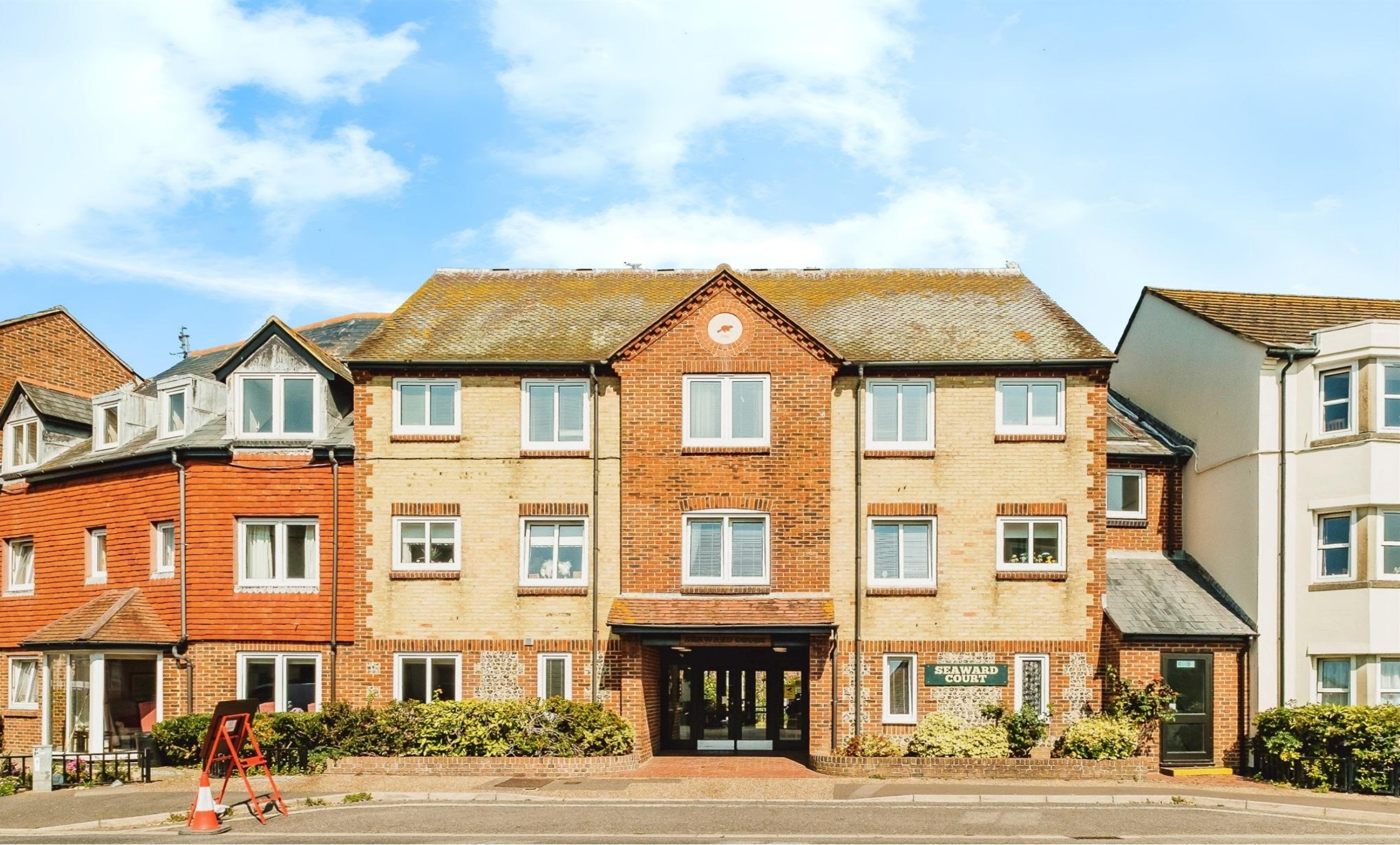
Seaward Court West Street, Bognor Regis PO21 1XJ