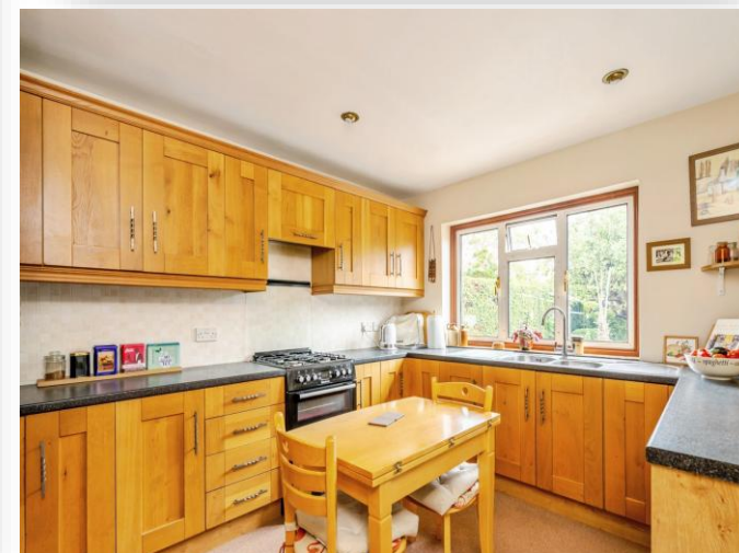
Lionel Avenue, Bognor Regis PO22 8LG