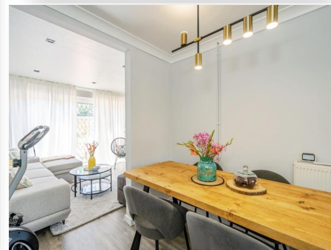
Hawkins Close, Bognor Regis PO21 3LW