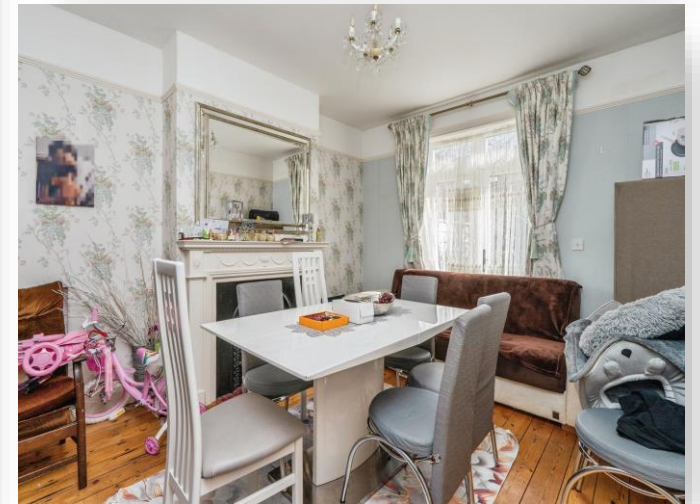
Grenada Spencer Street,Bognor Regis PO21 1AP