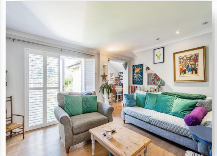
The Coast House Waterloo Road, Bognor Regis PO22 7EH