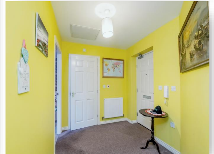
Huron Court Gravits Lane,BOGNOR REGIS PO21 5LT