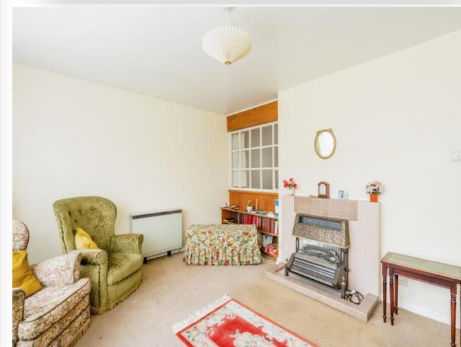
Norfolk Close, Bognor Regis PO21 2JB