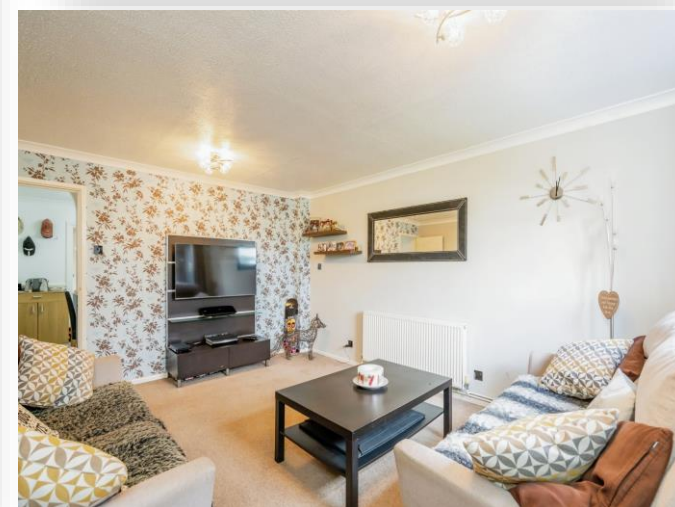
Osprey Gardens, Bognor Regis PO22 9QQ