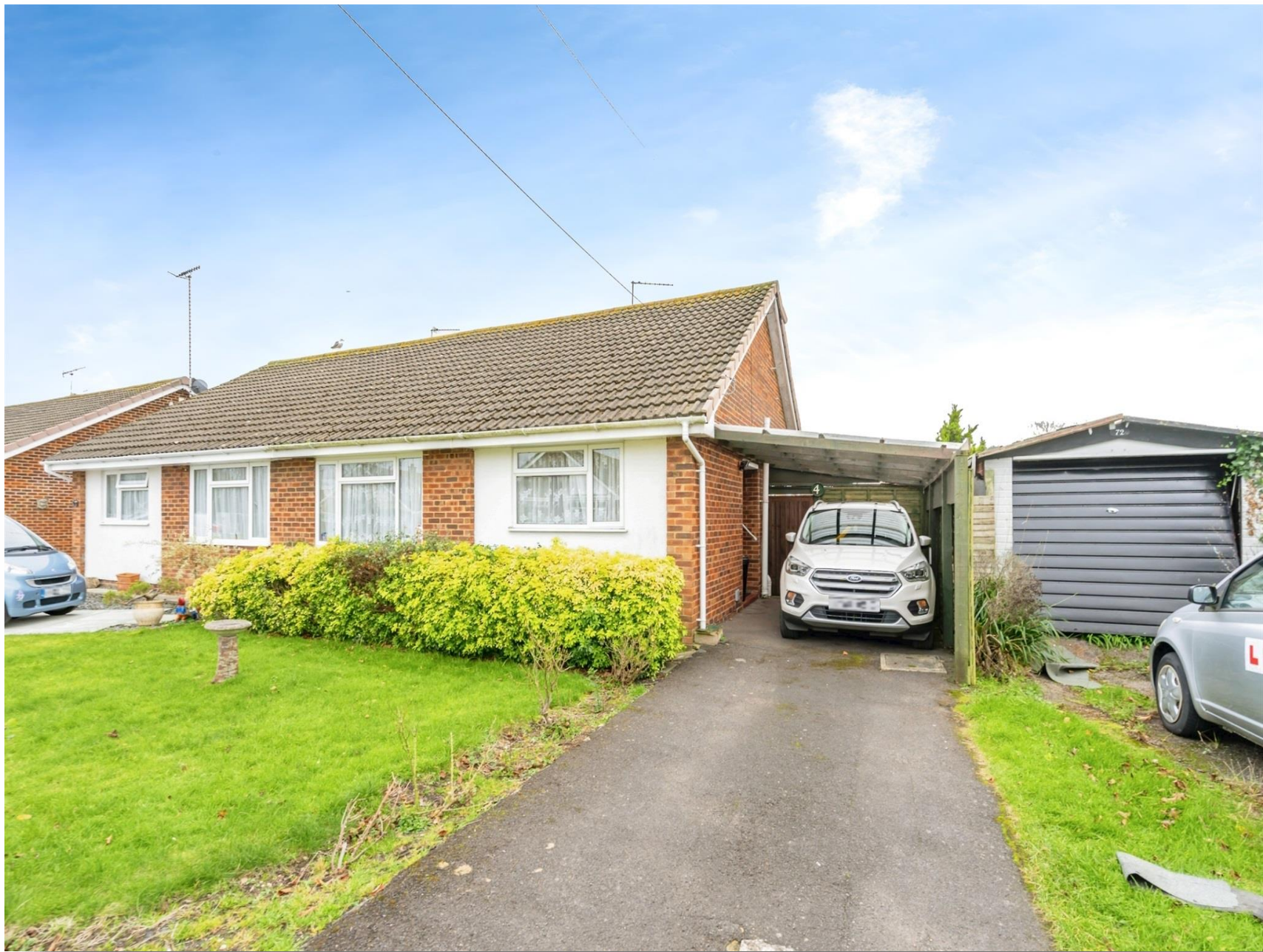
Marylands Crescent, Bognor Regis, PO22 8DW