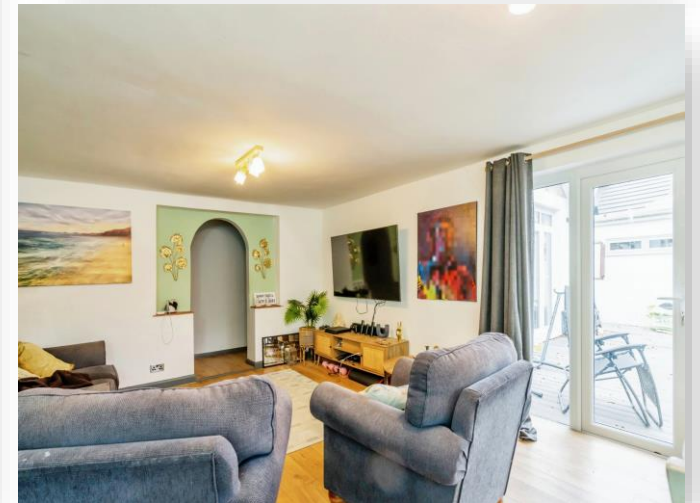
Aigburth Avenue, Bognor Regis PO21 3DA