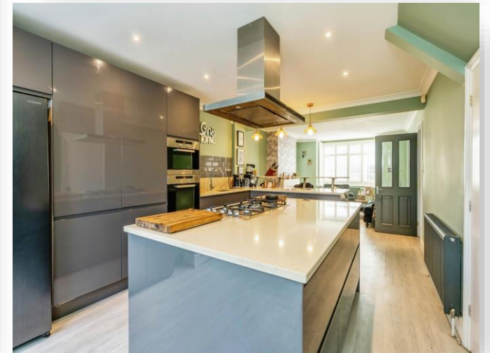
Limmer Lane, Bognor Regis PO22 7LP