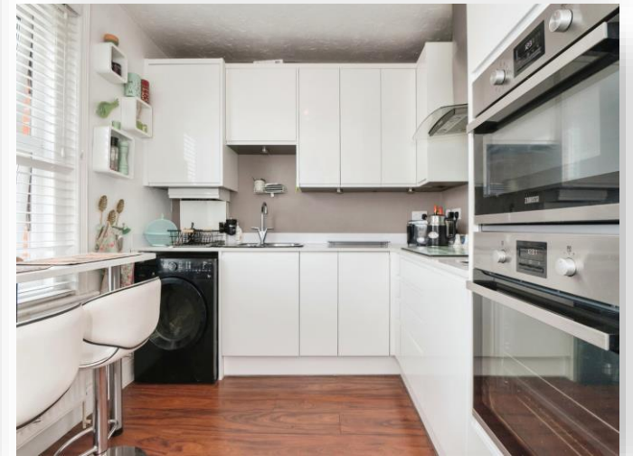
Bitterne Road West, Southampton SO18 1BL