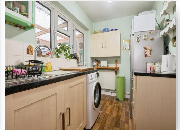
Meadowside Close, Southampton SO18 2LW