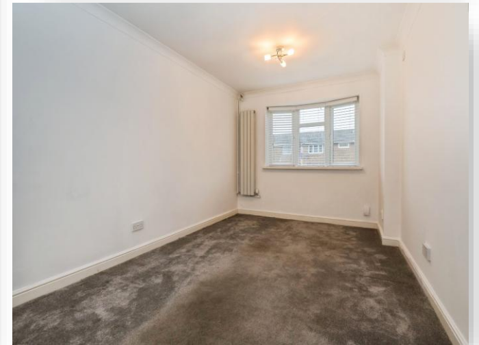
Church View Close, Southampton SO19 8SJ