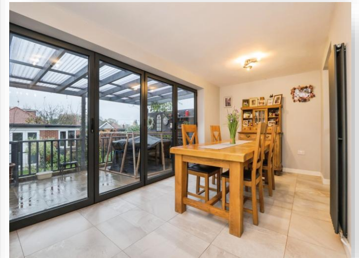
Chaucer Road, Southampton SO19 6QR