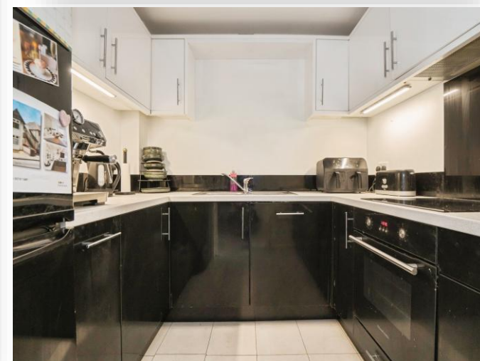
The Gatehouse, Cobbett Road, Southampton SO18 1HJ