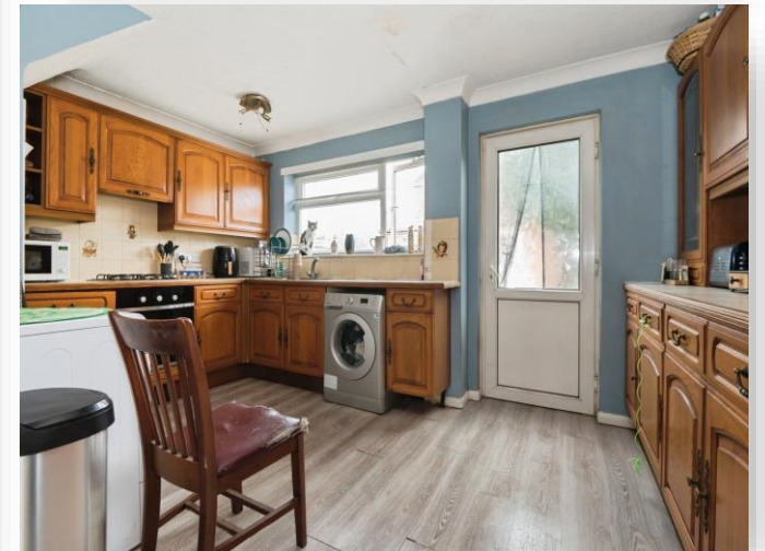
Lydgate Green, Southampton SO19 6LP