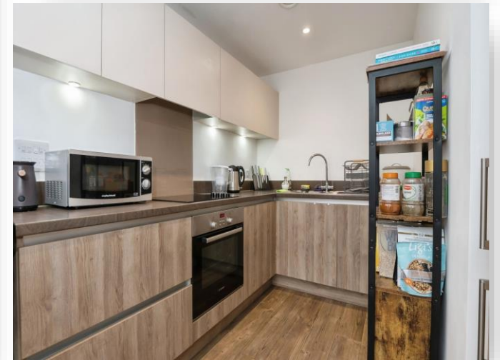
Anson Place, John Thornycroft Road, Southampton SO19 9UH