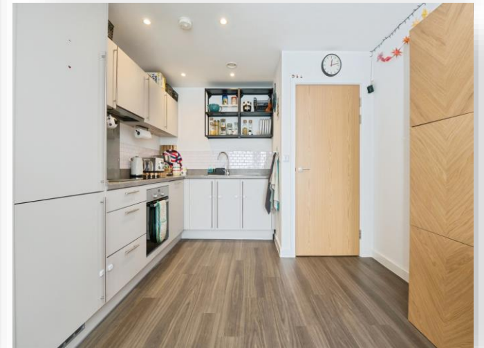
Ventura, Keel Road, Southampton SO19 9UU