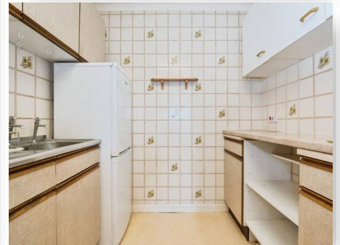
Home Spinney House, River View Road, Southampton SO18 1UD