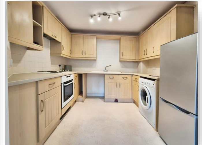
Eastside Court, Langstaff Way, Southampton SO18 6NP