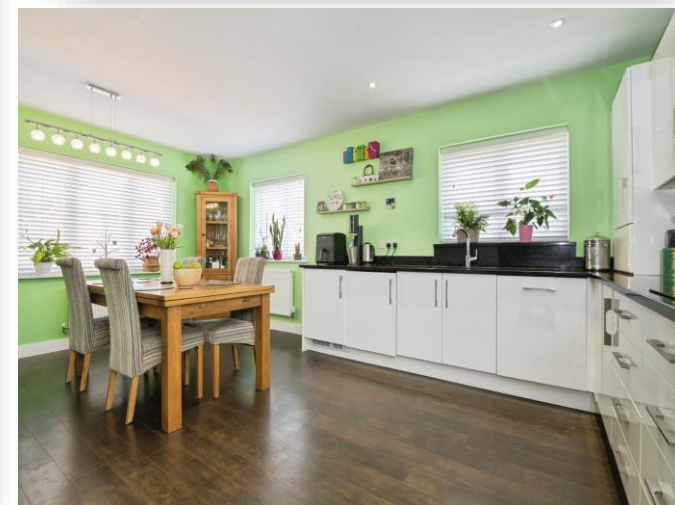
Mill Gardens, West End, Southampton SO18 3AG