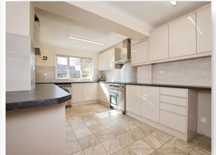
Chillerton, Netley Abbey, Southampton SO31 5GU