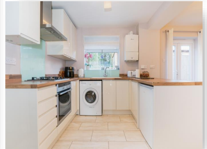
Wilmington Close, Southampton SO18 2RD