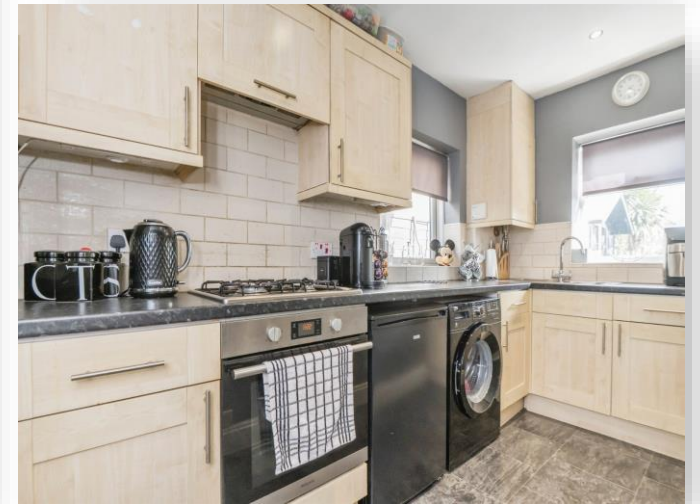
Butts Road, Southampton SO19 1BJ