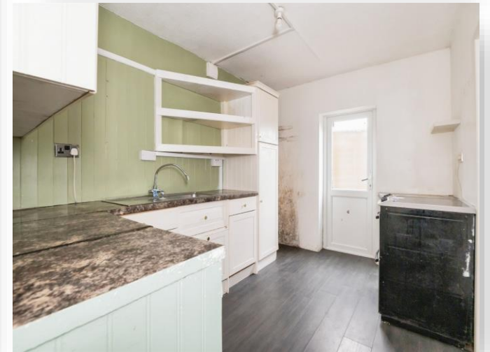
Spring Close, Southampton SO19 2NW