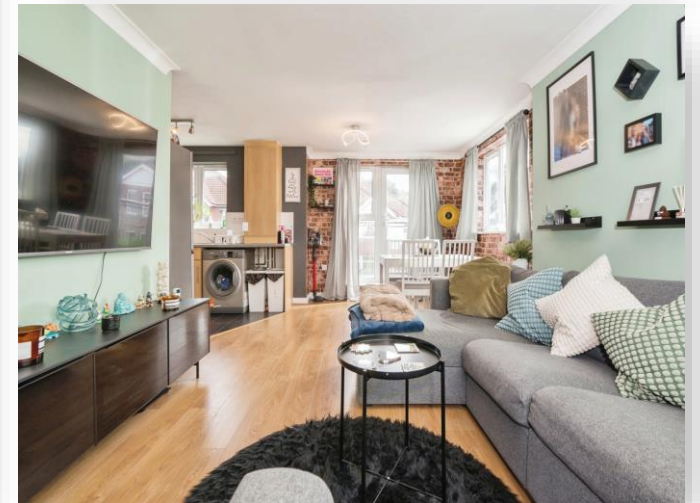
Poppy Fields, Bullar Road, Southampton SO18 1EJ