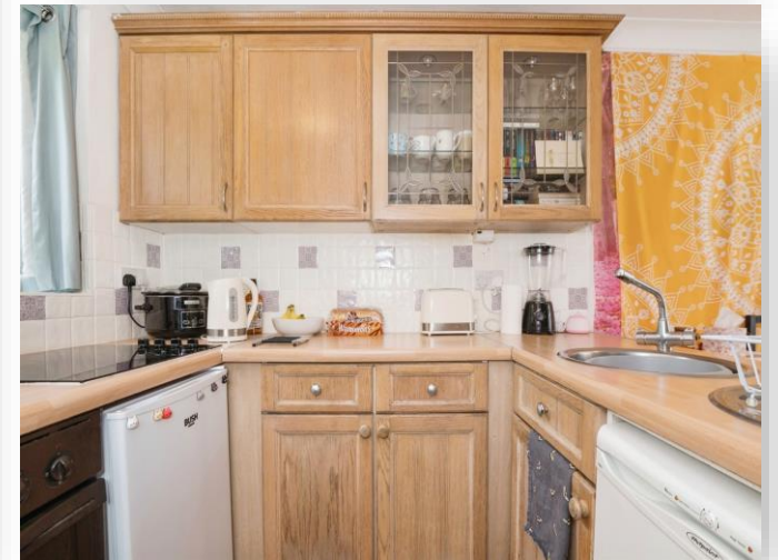
Creedy Gardens, West End, Southampton SO18 3LW