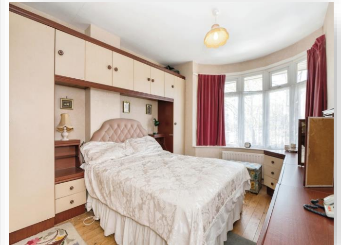
Panwell Road, Southampton SO18 6BJ