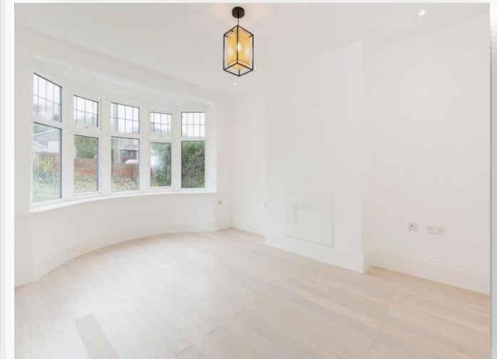
6 Gainsford Road, Southampton, SO19 7AR