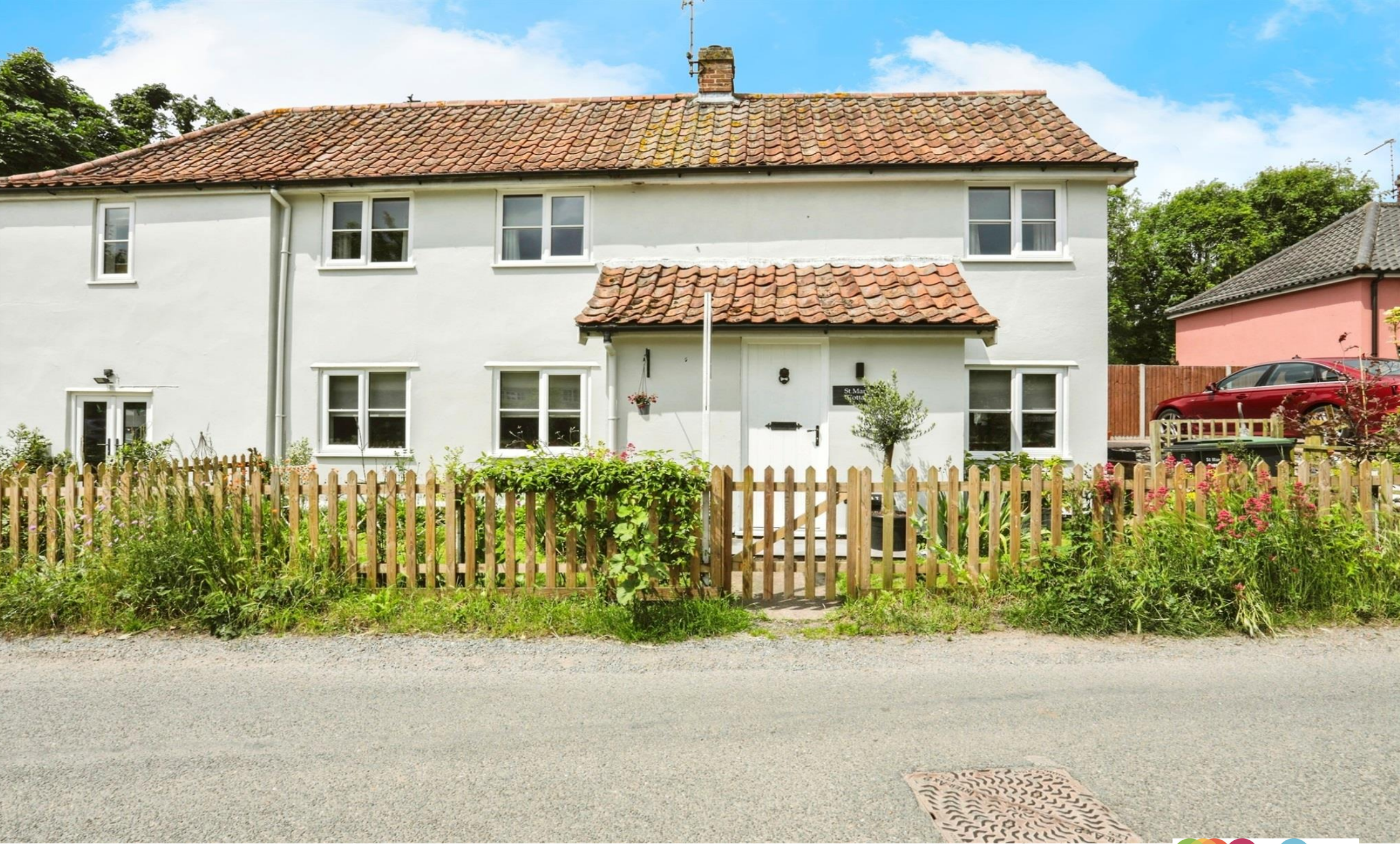
St. Marys Cottage Bickers Hill, Laxfield Woodbridge IP13 8DP