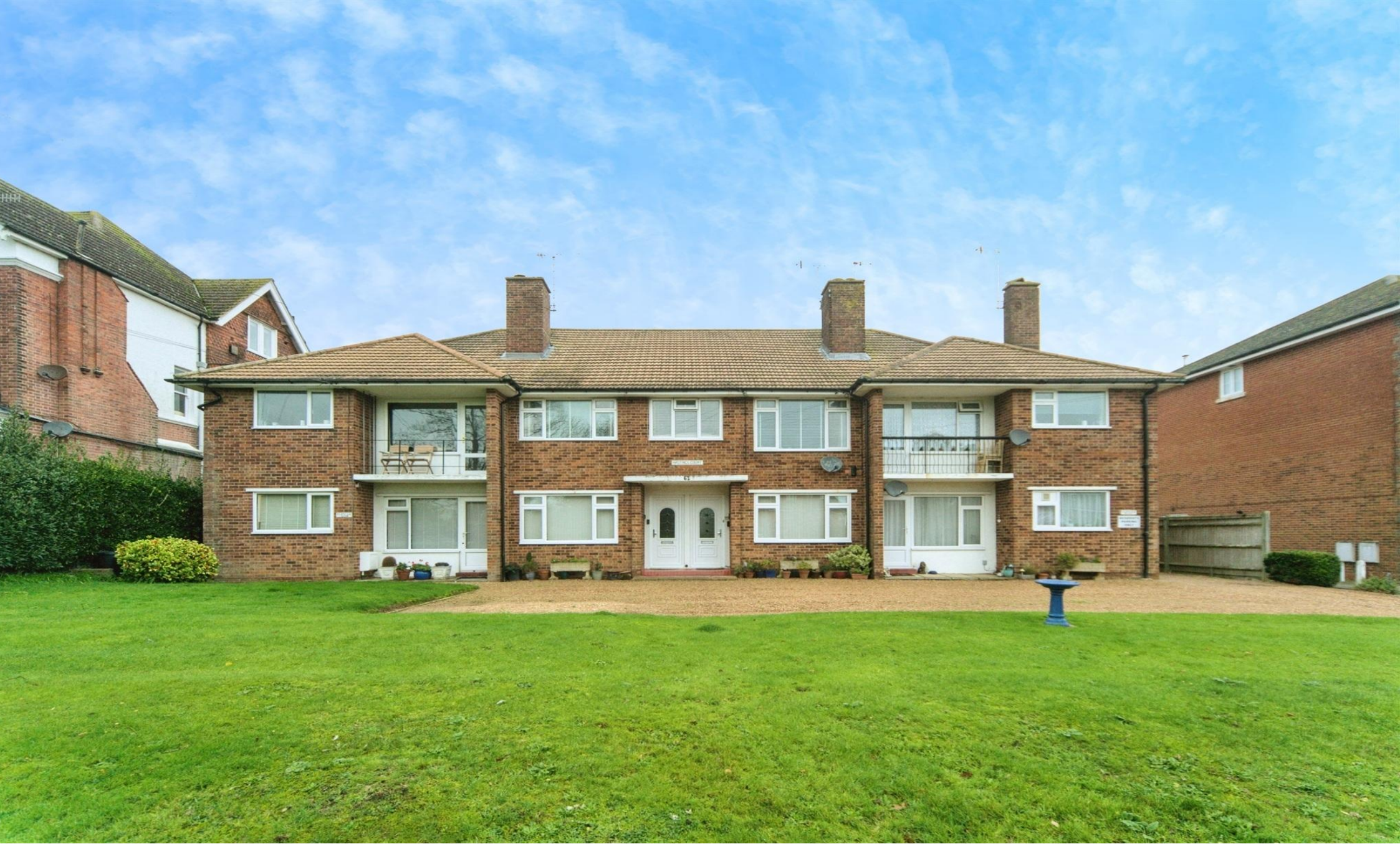
Hastings Court - Hastings Road, Bexhill-On-Sea TN40 2NH