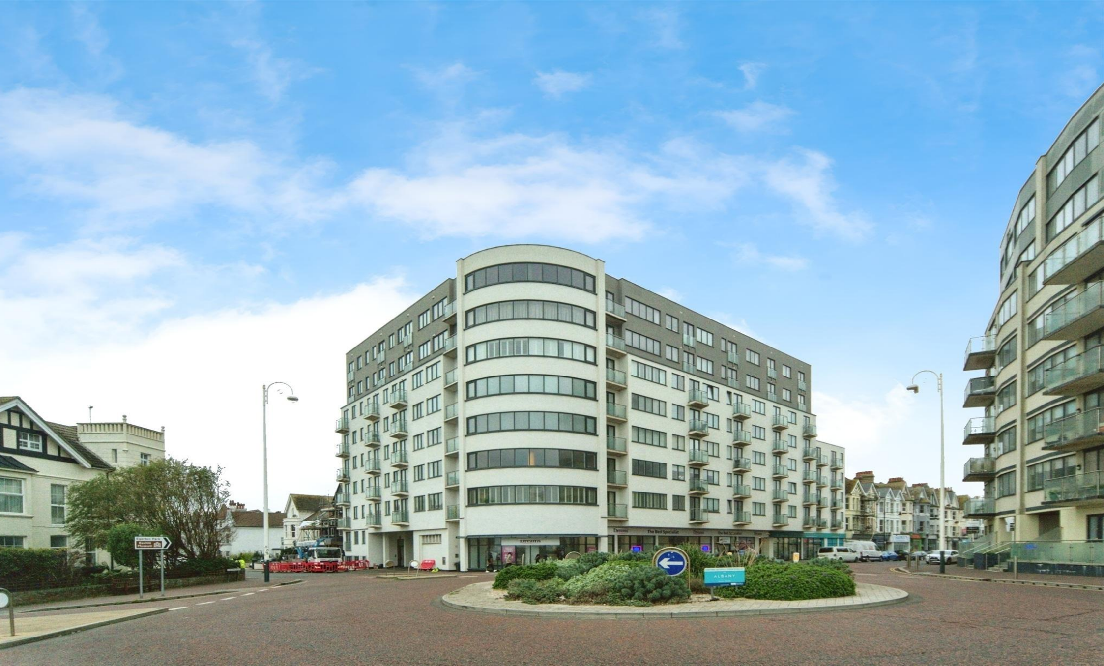
The Landmark - Sackville Road, Bexhill-On-Sea TN39 3FA