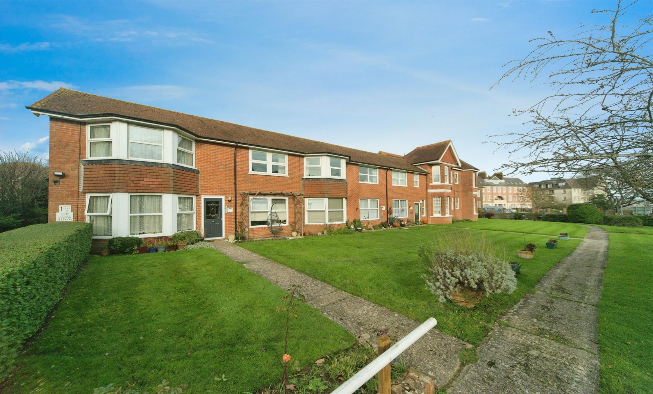
Laurel Bank - Hastings Road, Bexhill-On-Sea TN40 2NH