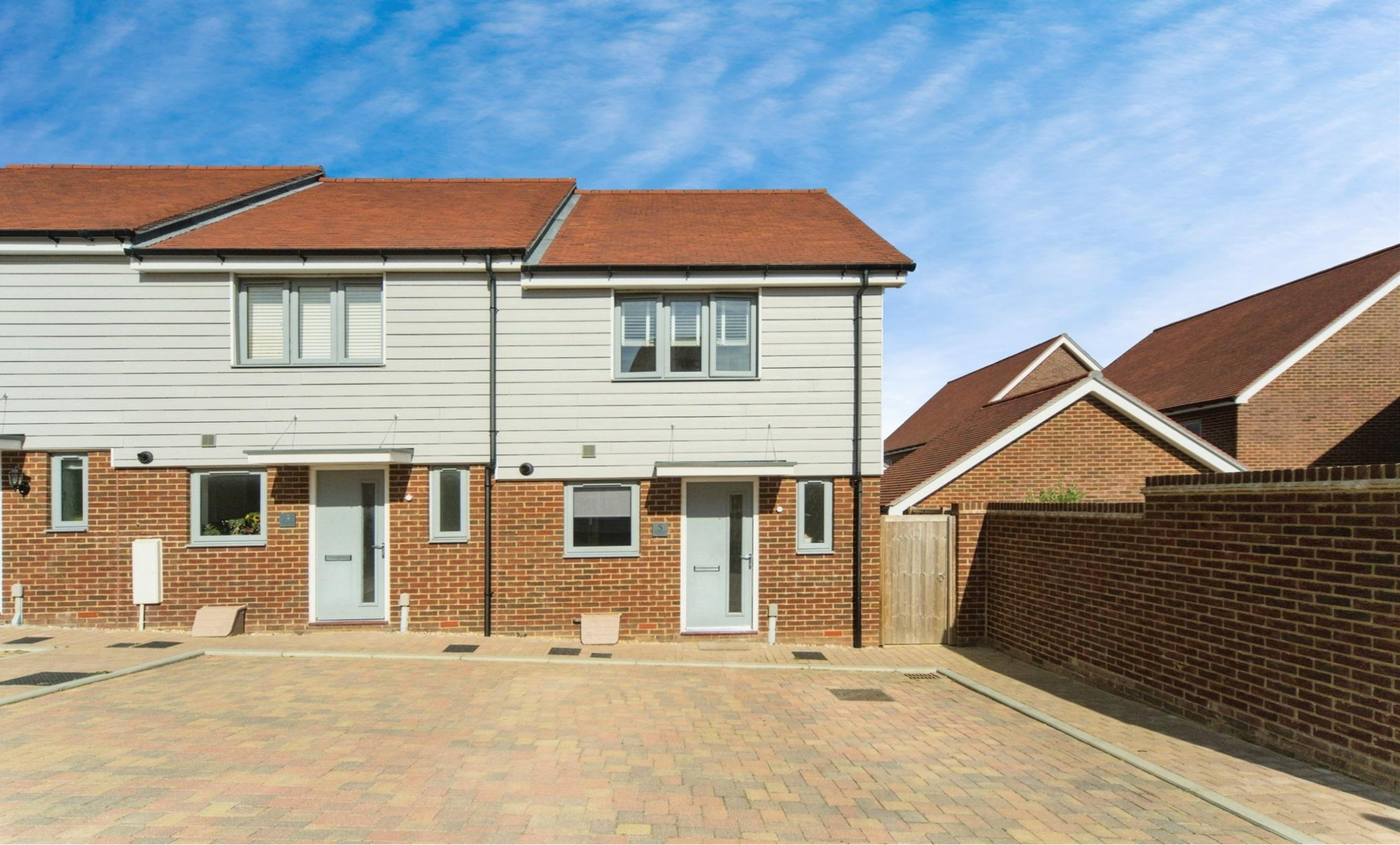
Buttercup Close, Bexhill-On-Sea TN40 2FU