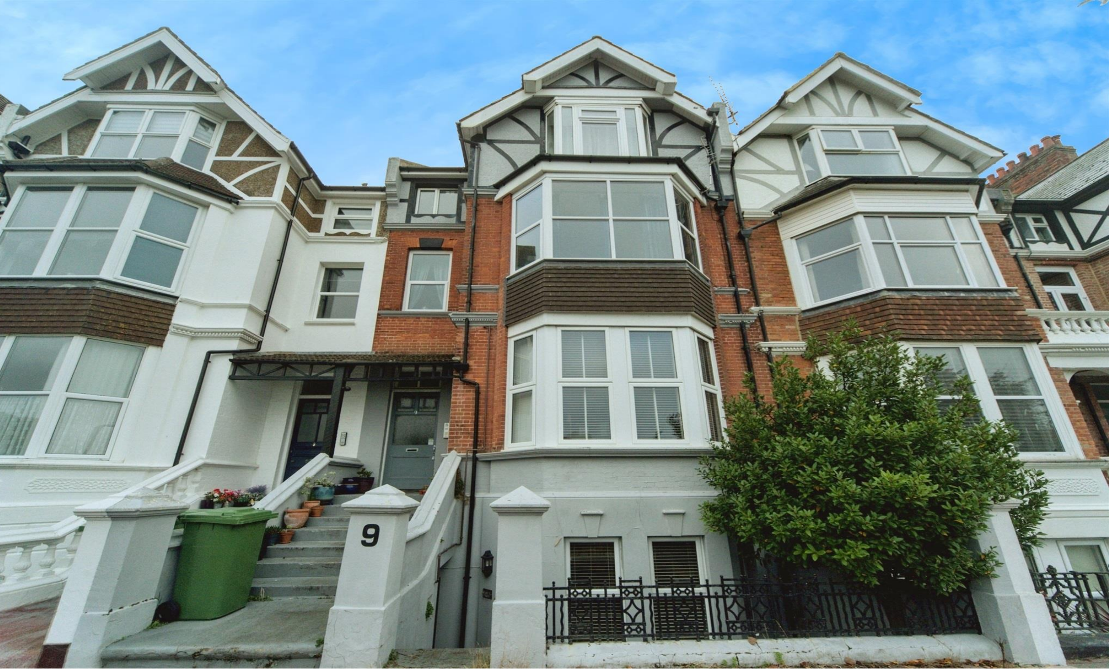
Park Road, Bexhill-On-Sea TN39 3HY