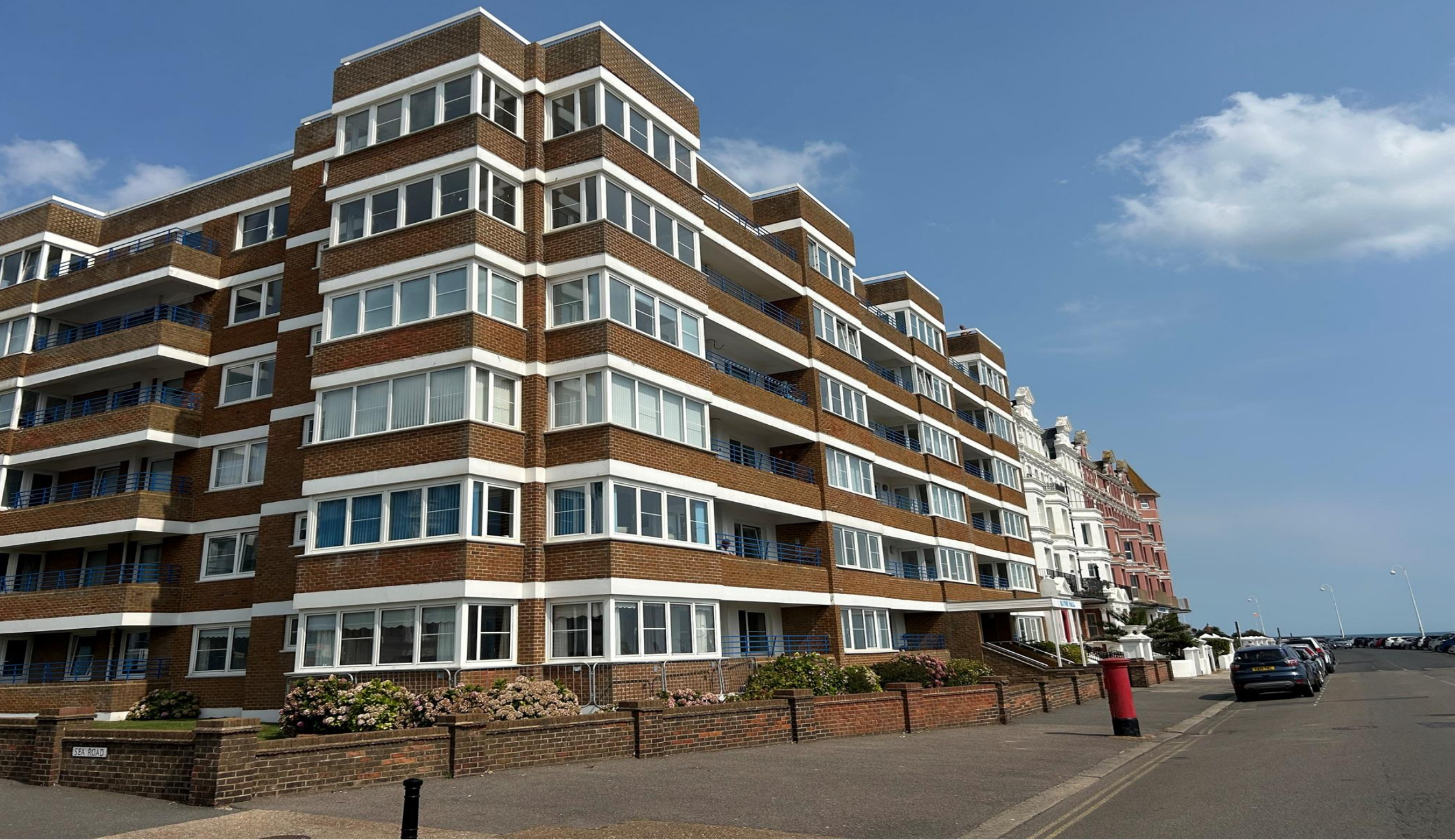
Glyne Hall, Bexhill-On-Sea TN40 1LY