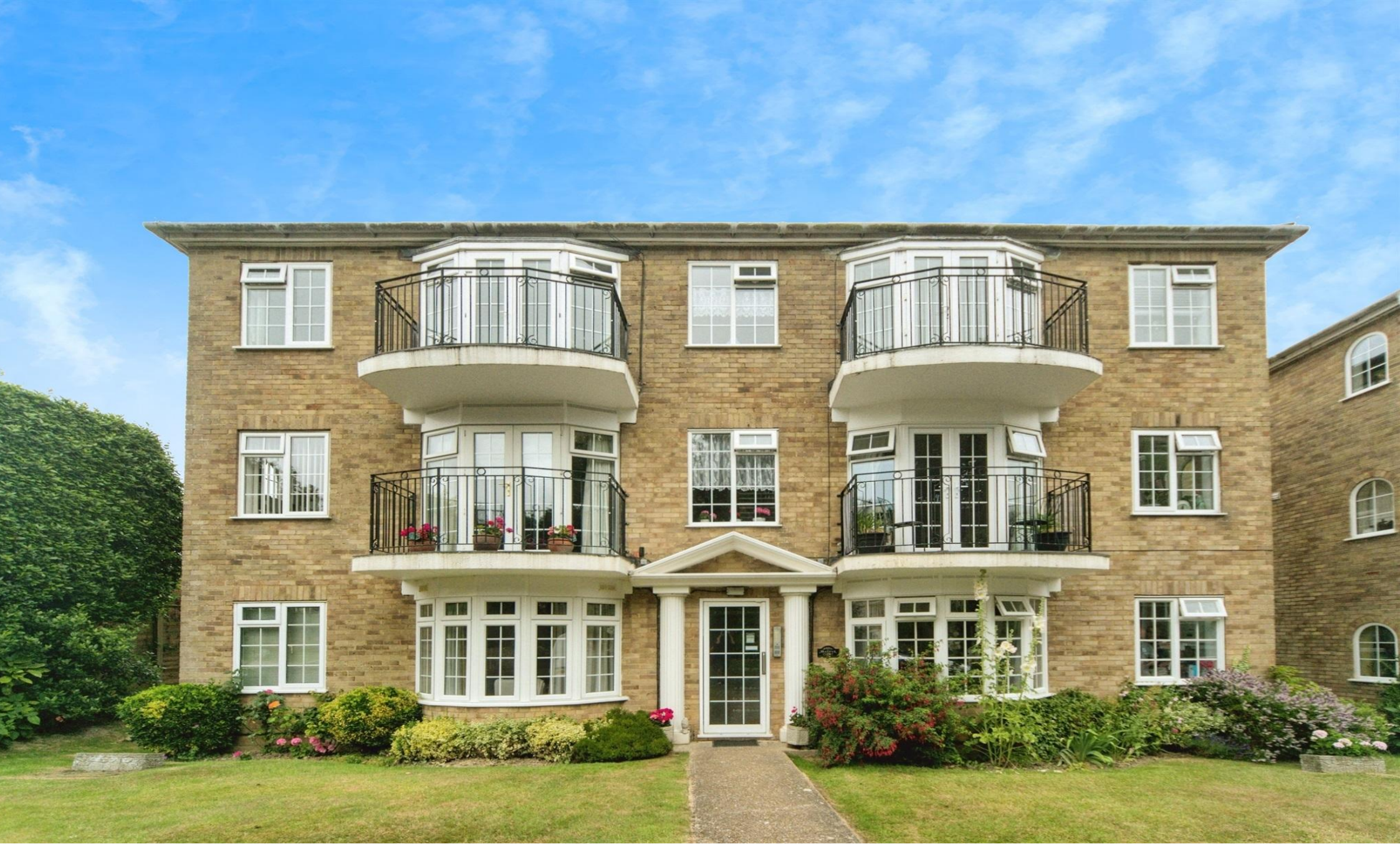
Braemar Court - Eridge Close, Bexhill-On-Sea TN39 3QY