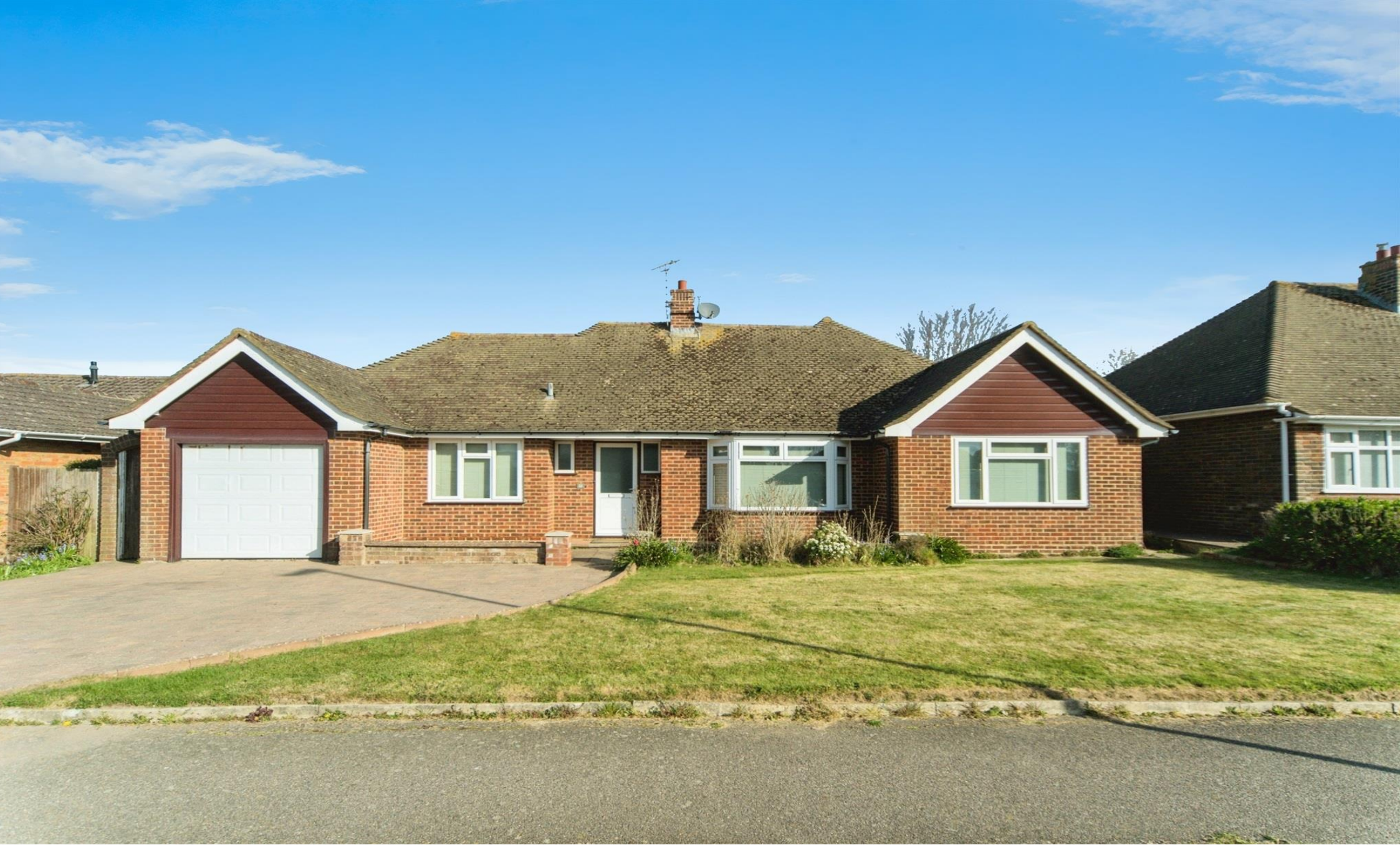
The Barnhams, Bexhill-On-Sea TN39 3RE