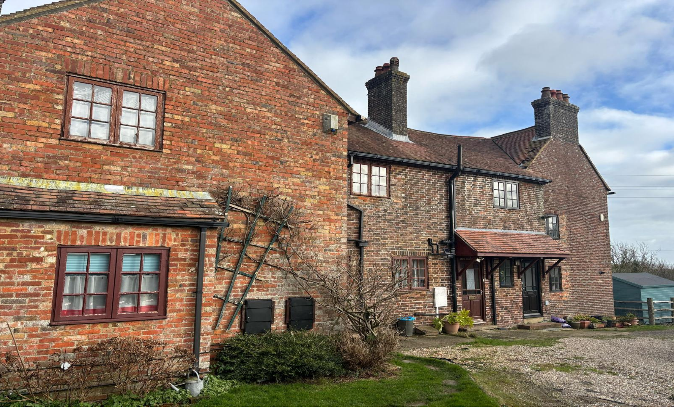
Pebsham Farm House Pebsham Lane, Bexhill-On-Sea TN40 2RZ