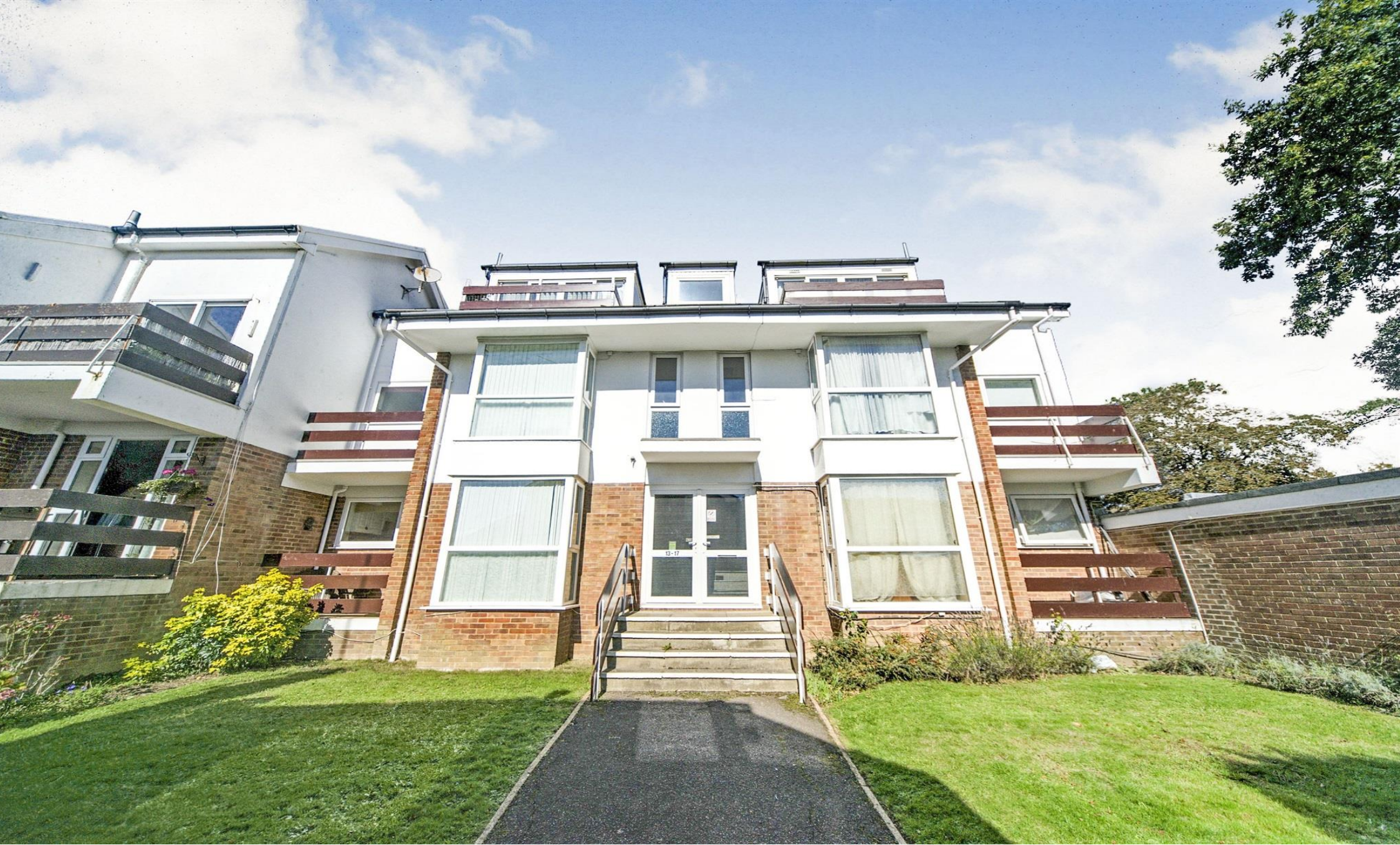
Pinewoods Court Pinewoods, Bexhill-On-Sea TN39 3UD