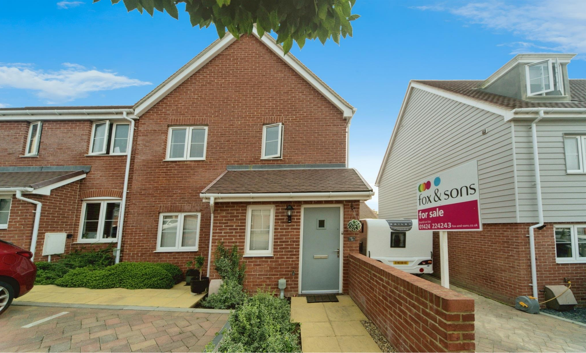
Preston Hall Close, Bexhill-On-Sea TN39 5FB