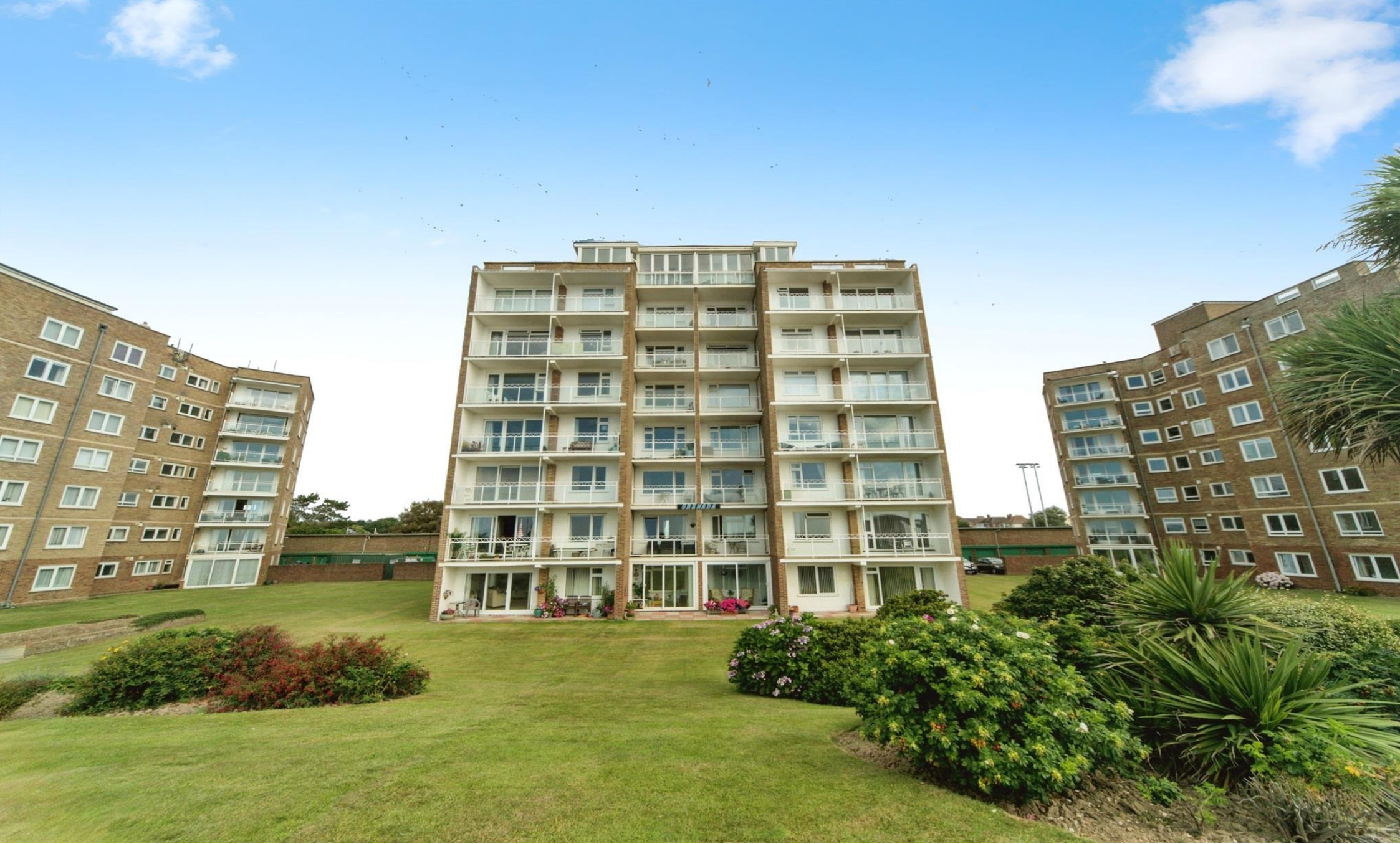
Grenada - West Parade, Bexhill-On-Sea TN39 3DP