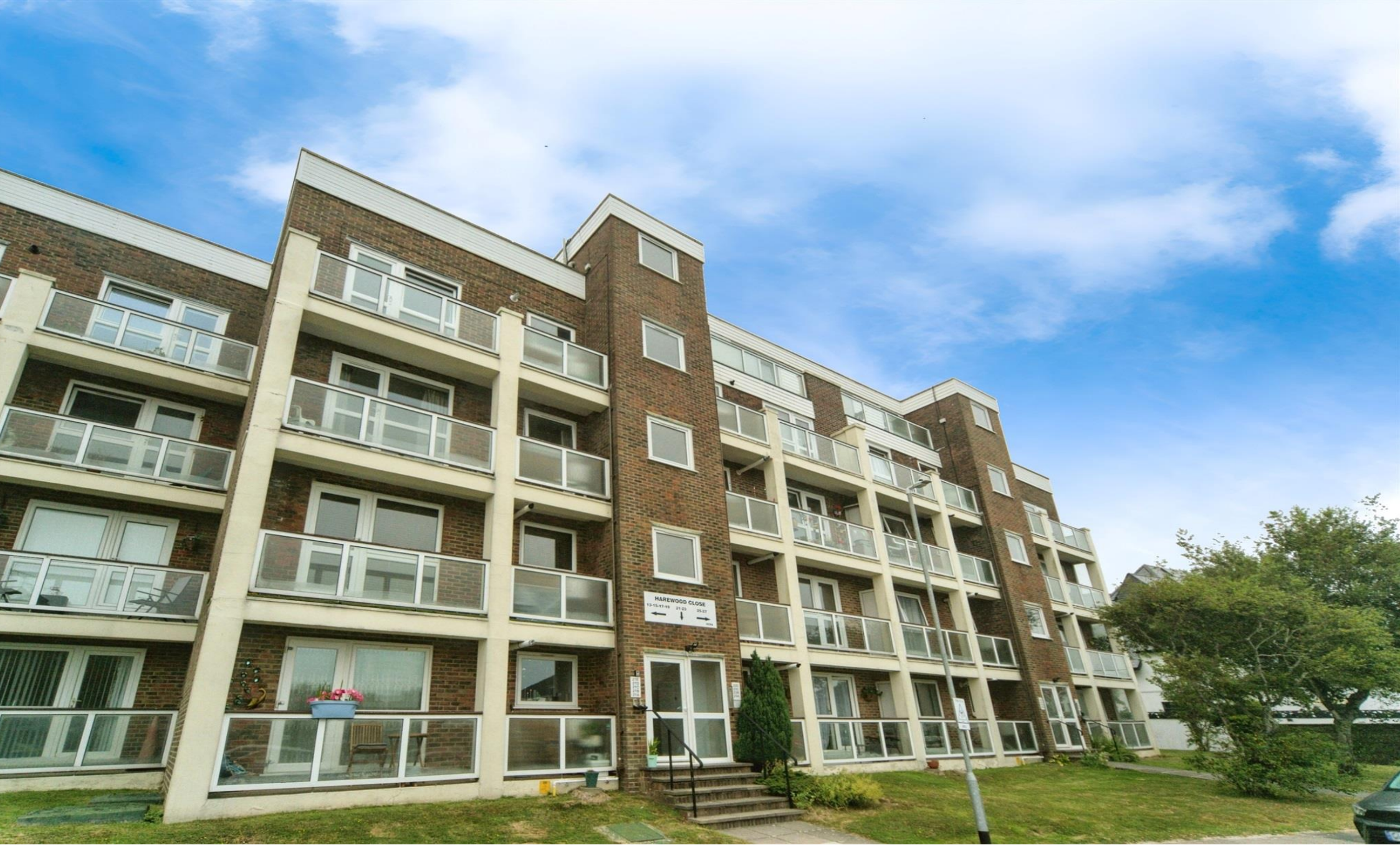
Harewood Close, Bexhill-On-Sea TN39 3LX